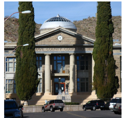
Mohave County Court House

Abe Hamadeh is challenging the outcome of the election in court. Last week, the Mohave County Superior Court scheduled oral arguments for Hamadeh’s Motion for a New Trial. Hamadeh filed a Motion for New Trial after discovering new voter discrepancies in Pinal County. Oral arguments will take place on May 16. The fate of a new trial now rests in the hands of the judges on whether they will grant the motion for a new trial. According to AZ Free News, Abe Hamadeh’s legal team has over 250 affidavits from allegedly disenfranchised voters.